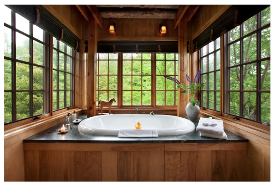
The Maple room bath in the Farmhouse at Copper Hill at Twin Farms Twin Farms

Set on 300 acres of wildflower meadows and rolling hills in central Vermont, this intimate country retreat can feel like a bucolic second home — albeit one with a private art collection, a huge variety of outdoor activities and no one under age 16. Guests are free to explore the grounds independently or with a guide, read a book next to the fire at the Copper Hill Library or borrow one of the hotel's BMWs for an excursion. The farm-to-table culinary program is also customized: Guests forgo menus and entrust the chef to deliver each course based on their stated preferences.