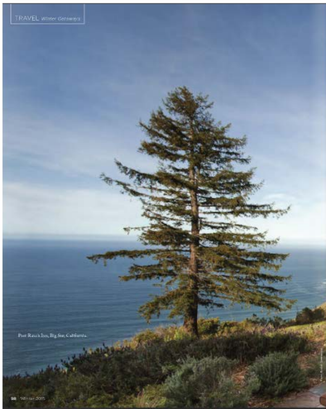
Post Ranch Inn, Big Sur, California