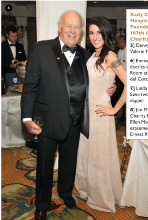
Rady Children's Hospital Foundation's 107th Annual Charity Ball