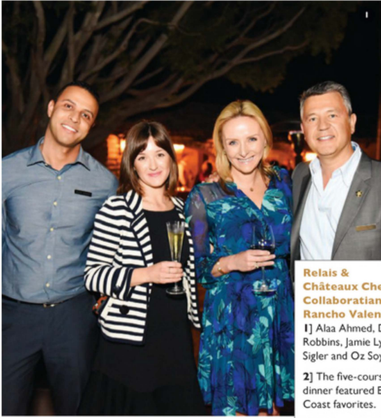
Relais & Châteaux Chef Collaboration at Rancho Valencia