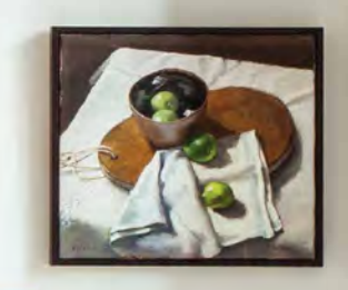
ANTIQUING Along Coastal Maine