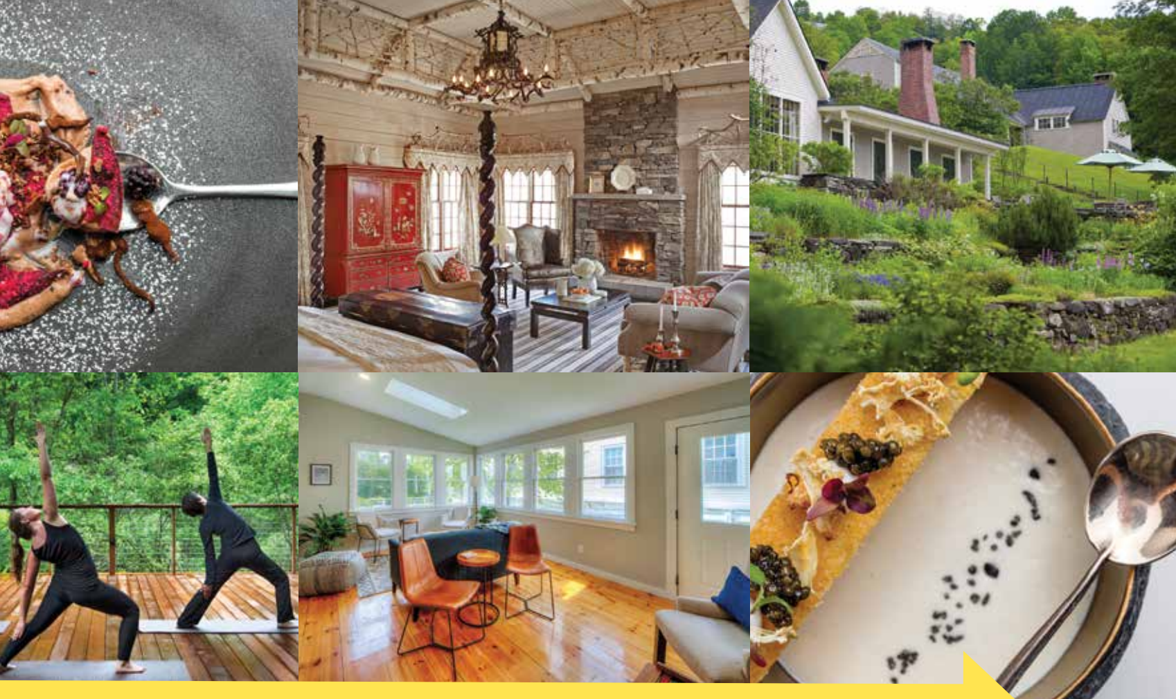
ENJOY A MEMORABLE GETAWAY WITHOUT LEAVING NEW ENGLAND.