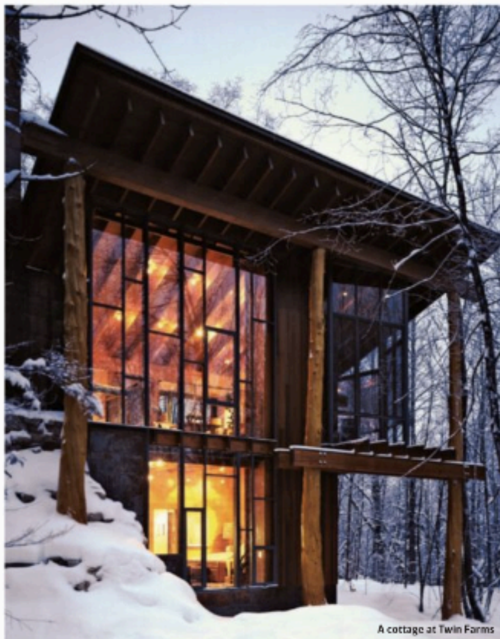
A cottage at Twin Farms