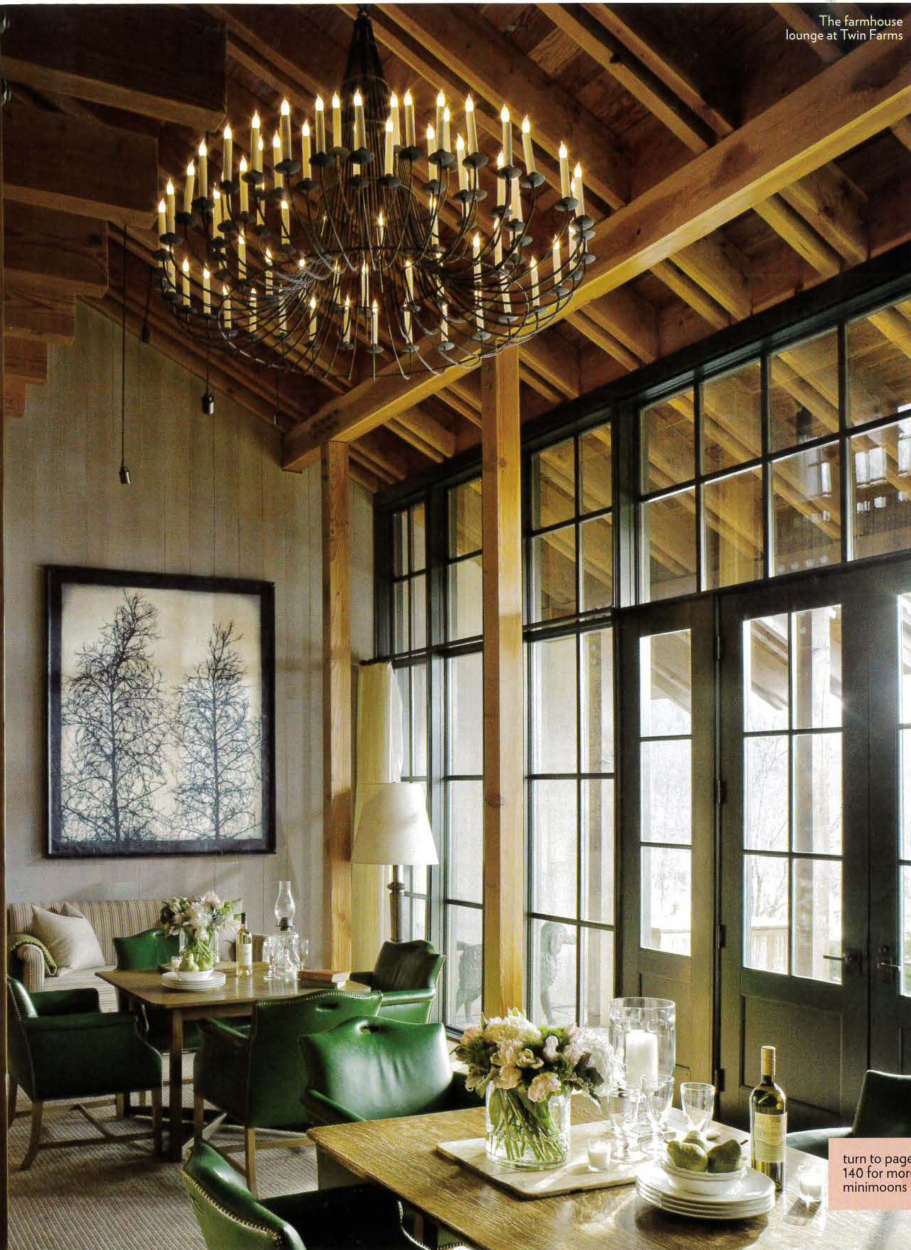
The farmhouse lounge at Twin Farms