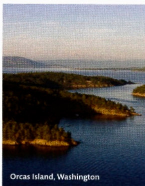
Orcas Island, Washington

TV personality, shoe designer for Chinese Laundry, and Chicago resident