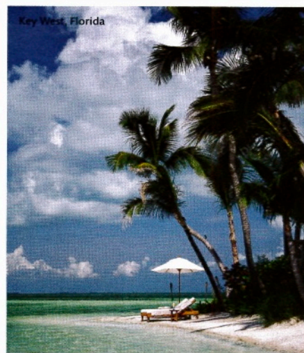
Key West, Florida

Radio show host, Miami resident, and daughter of Jimmy Buffett