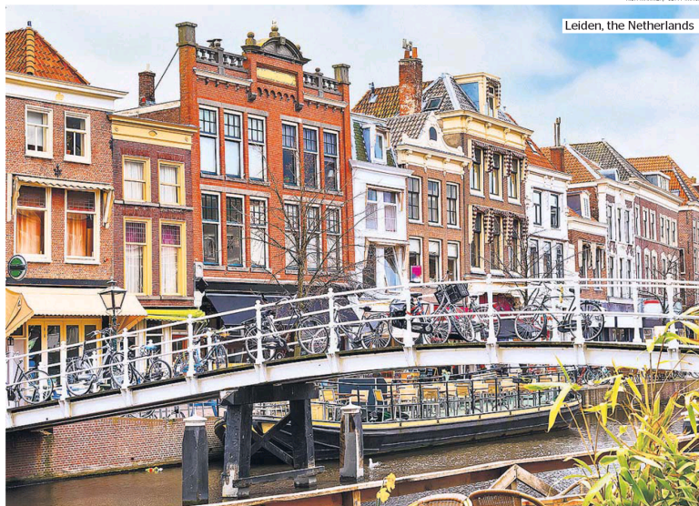
Leiden, the Netherlands