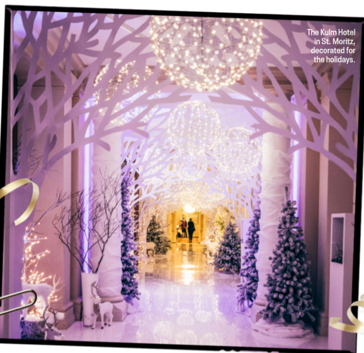
The Kulm Hotel in St. Moritz, decorated for the holidays.

✓ DO Arrange to have clothes shipped, unpacked, and steamed ahead of your arrival.