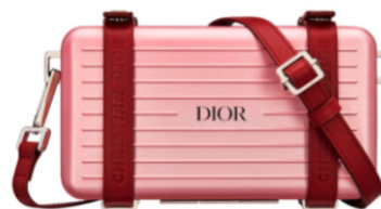
A suitable case for top secret party favors. DIOR MEN "DIOR X RIMOWA" PERSONAL CLUTCH (PRICE ON REQUEST), 800-929-DIOR

This 40-acre resort in Puglia, with white stone walls, winding alleys, and picturesque piazza, is an elevated version of a traditional village in a blessedly little-traveled part of Italy. (Justin Timberlake and Jessica Biel married here in 2012.) There are so many venues (two private beaches, several restaurants and pools) that no two events will be the same.