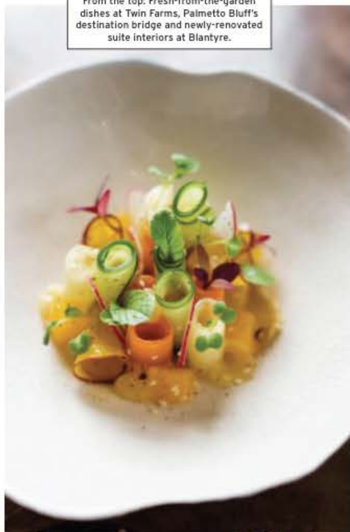
From the top: Fresh-from-the-garden dishes at Twin Farms, Palmetto Bluff's destination bridge and newly-renovated suite interiors at Blantyre.