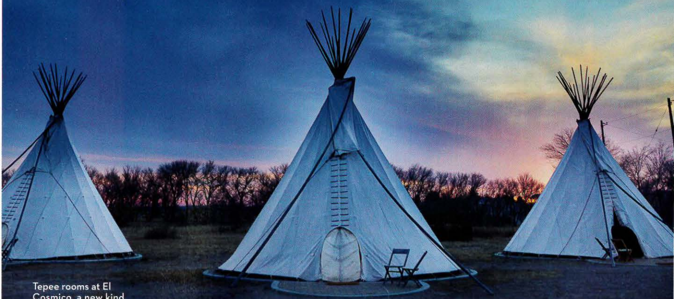
Teepee rooms at El Cosmico, a new kind of desert honeymoon in Marfa, Texas

NO MATTER WHAT KIND OF EXPERIENCE YOU CRAVE, THERE'S A CLASSIC RESORT OR TRENDY NEWCOMER—RIGHT HERE IN THE U.S.