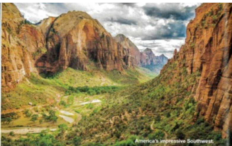
America's impressive Southwest.