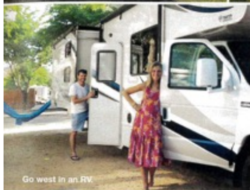
Go west in an RV.