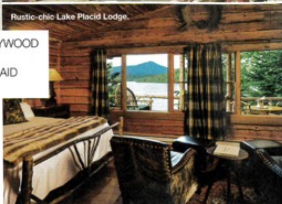
Rustic-chic Lake Placid Lodge.

FUN FACT: ROAD TRIP MOVIES HAVE BEEN A HOLLYWOOD STAPLE SINCE THE 1930s. THE 1931 PARAMOUNT PICTURES RELEASE OF "HUCKLEBERRY FINN" IS SAID TO HAVE BEEN THE FIRST OF THE FILM GENRE.