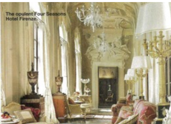
The opulent Four Seasons Hotel Firenze.