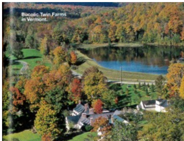
Bucolic Twin Farms in Vermont.